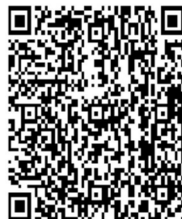
Tap QR Code for more details