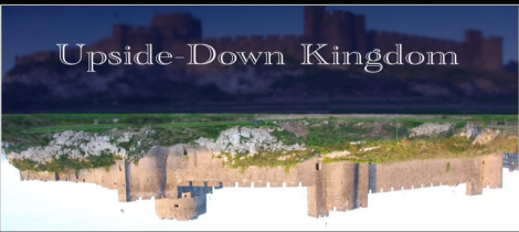
The Kingdom of Heaven: A Different Way to Think

Order forms ~ on table in narthex ~ cost ~ $40 per vase ~there are 2 vases