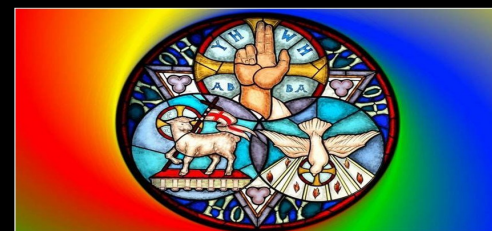
Holy Trinity Sunday